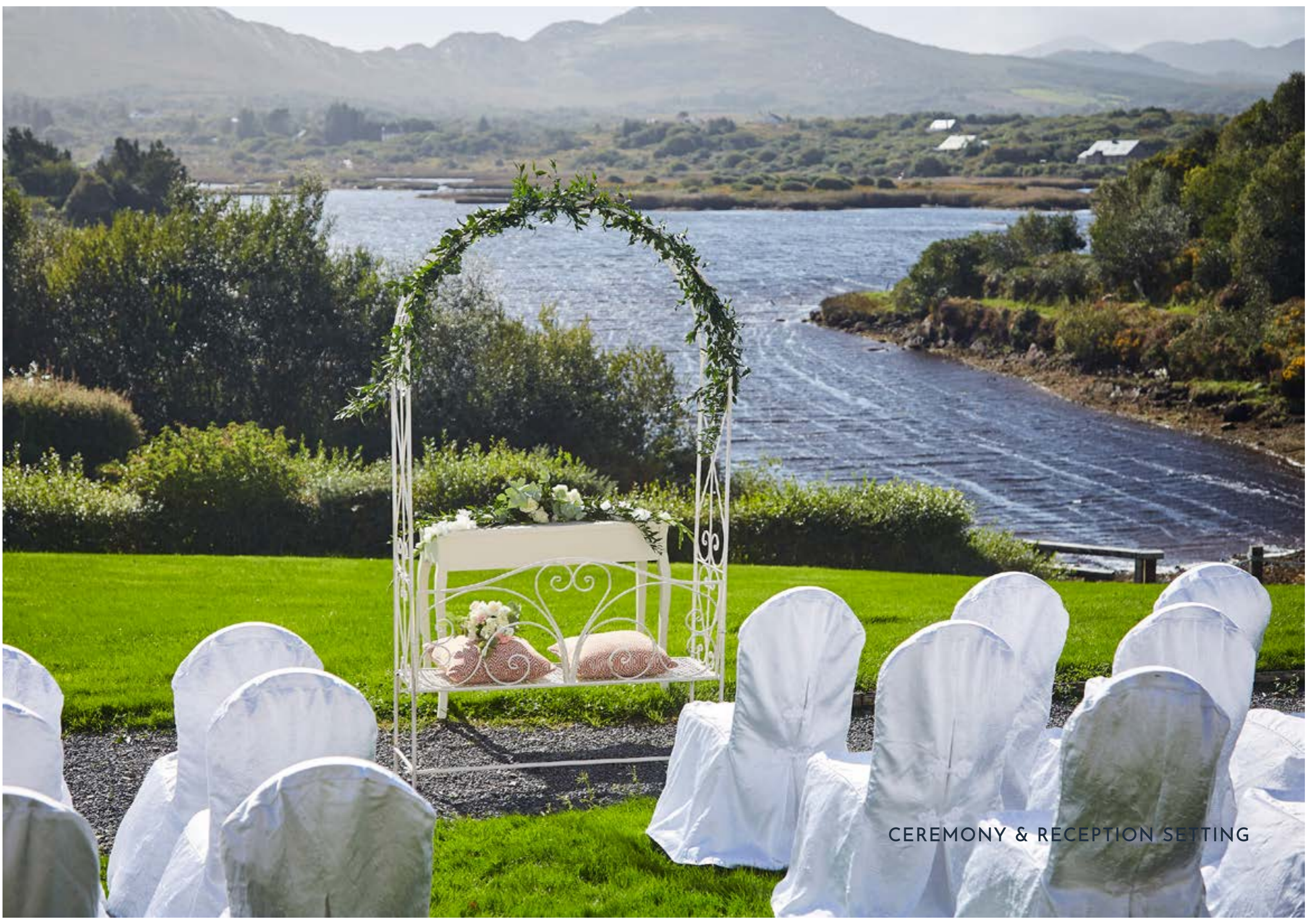
CEREMONY & RECEPTION SETTING